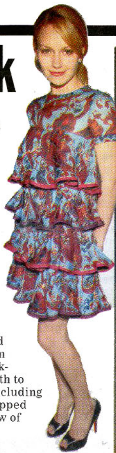
Becki Newton in Gucci.