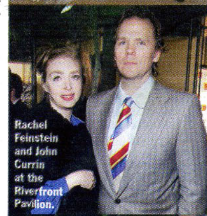
Rachel Feinstein and John Currin at the Riverfront Pavilion.