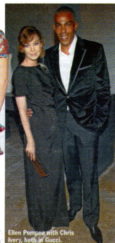
Ellen Pompeo with Chris Ivery, both in Gucci.